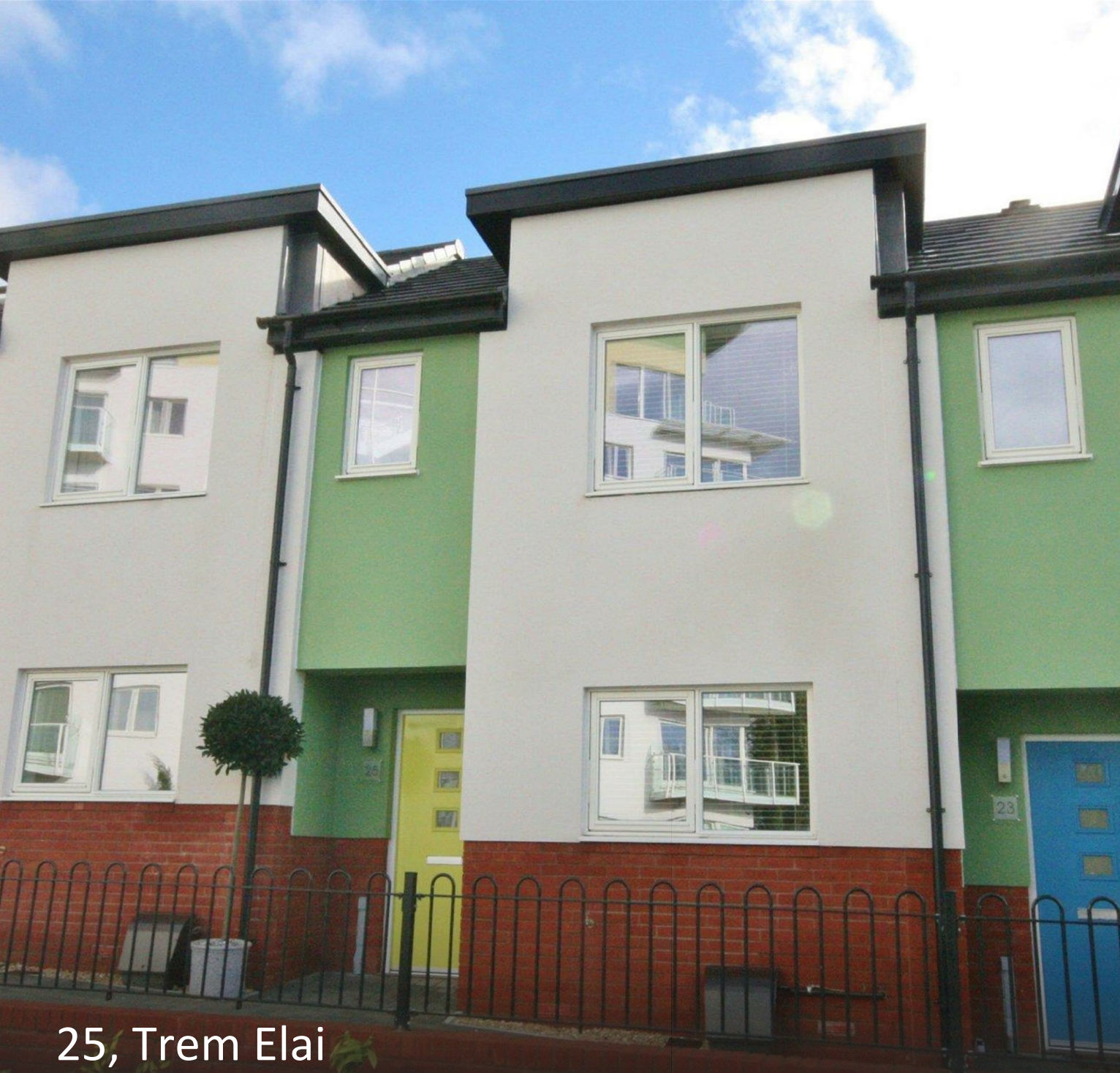
25, Trem Elai Penarth, CF64 1TB